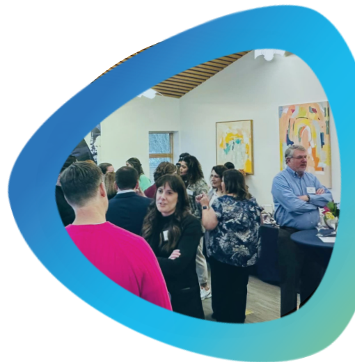
Guests at the April 20 Celebration of Youth event.