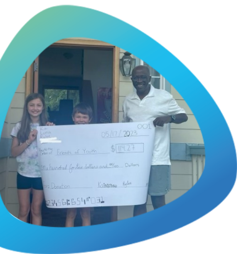
A generous donation from Rylee and Kai in honor of our Celebration of Youth.

Together, in April, we raised over $425,000 during our month-long Celebration of Youth events! Thank you to everyone who joined us in accomplishing our goals to support our youth and young adult partners and program services.